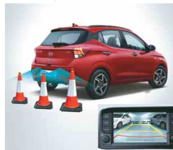
Rear parking camera with display on audio