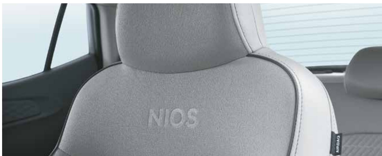
Semi fabric seat with piping