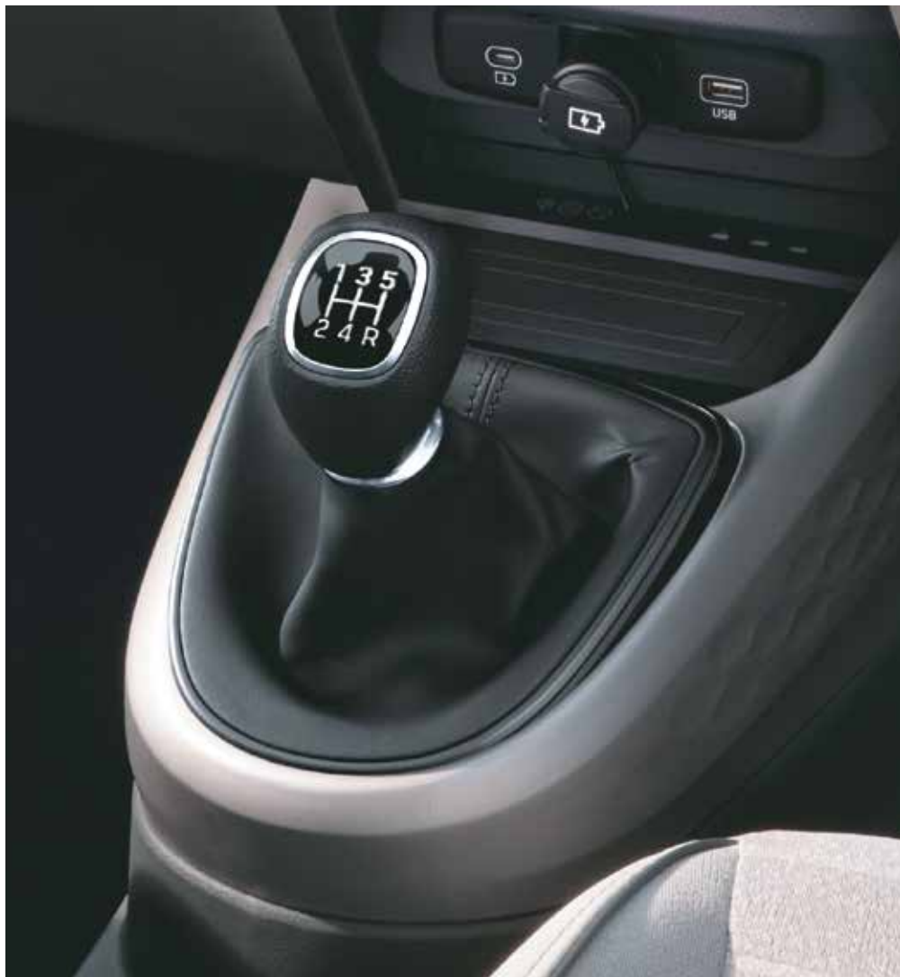
Manual transmission (MT)