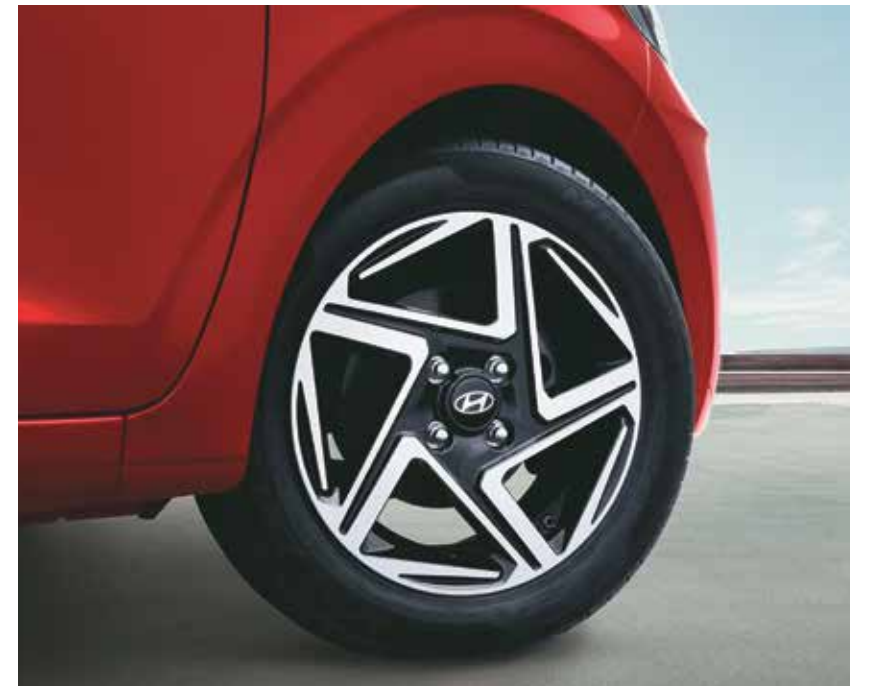
R15 (D=380.2 mm) diamond cut alloy wheels