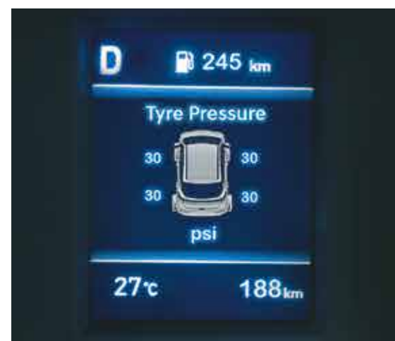
Tyre pressure monitoring system (TPMS) - highline