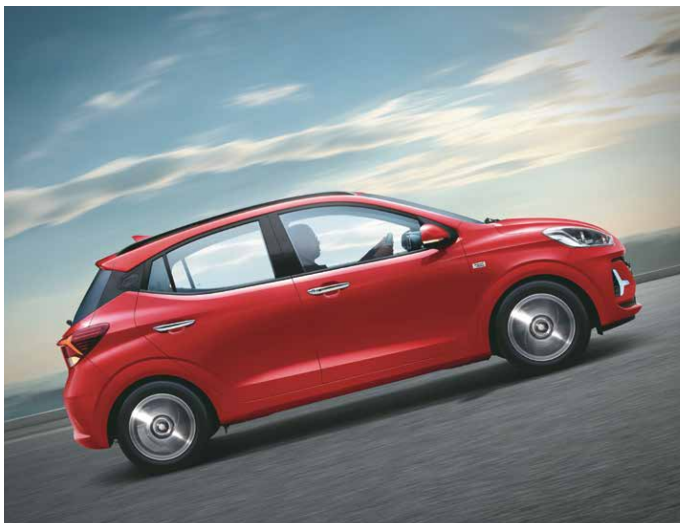
Hill-start assist control (HAC)

The Grand i10 NIOS comes equipped with various safety features. It features 6 airbags with side and curtain for added safety of all occupants. DVRM (Driver rear view monitor), Electronic Stability Control (ESC), Vehicle Stability Management (VSM) and Hill-start assist control (HAC) give you the confidence to drive freely.