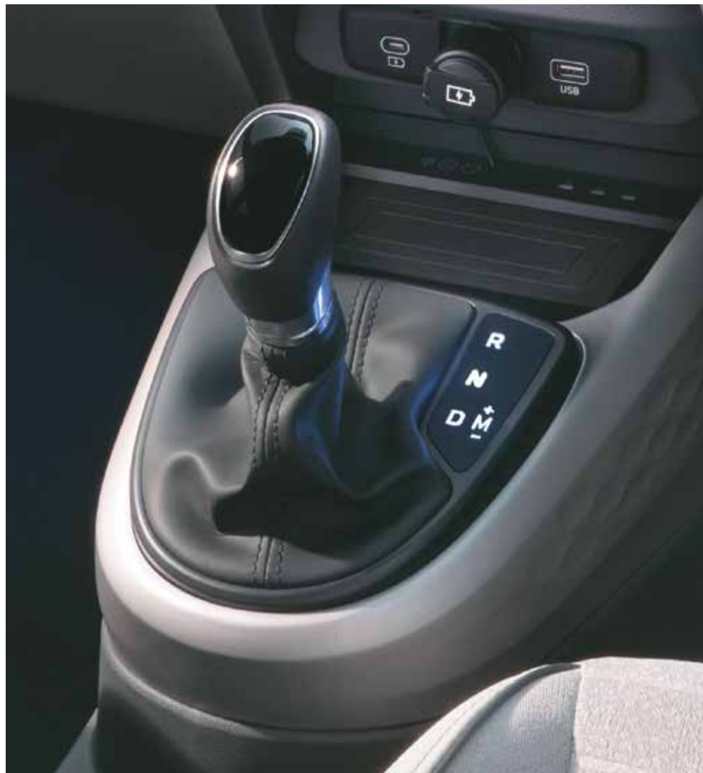
Automated manual transmission (AMT)