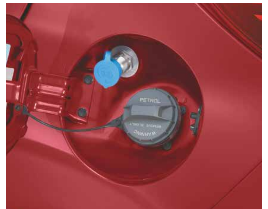
Convenient CNG filling with fast refuelling nozzle (near petrol filling area)

Other features : Leak-proof design | CNG tank capacity: 60L (water equivalent) Fire extinguisher placed under the seat for easy access