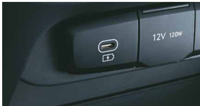
Fast USB charger (Type C)