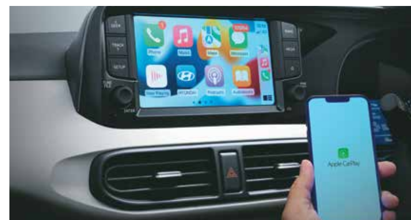
Apple CarPlay and Android Auto

Other features: Steering mounted audio & bluetooth controls