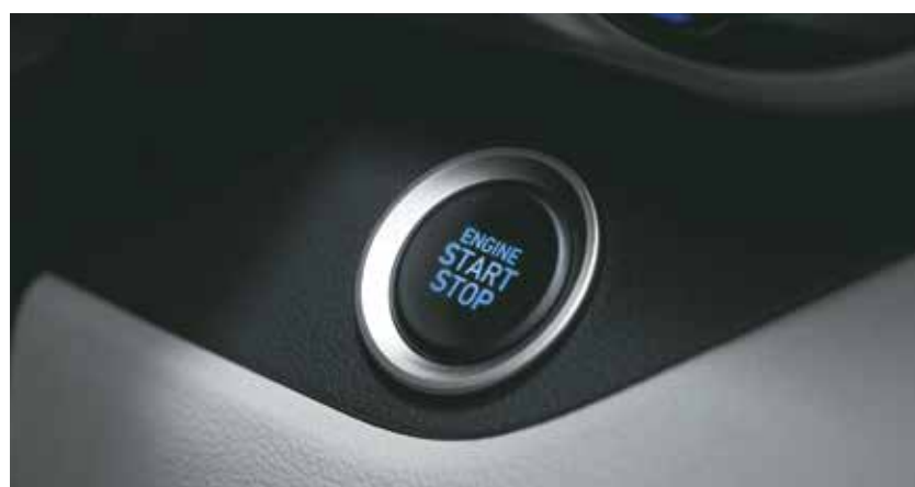
Smart key with push button start/stop