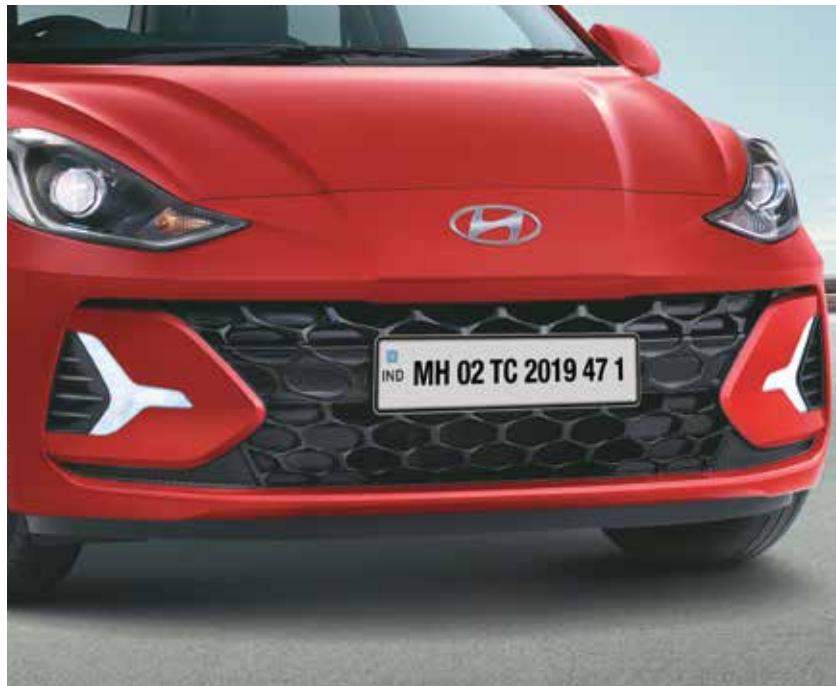
Painted black radiator grille

Style meets sophistication in the Grand i10 NIOS. The painted black radiator grille and LED daytime running lamps (DRLs) give it that refreshing look. The R15 (D=380.2 mm) diamond cut alloy wheels project an agile stance. And the tail gate design with LED tail lamps defines its sharp rear profile, giving the Grand i10 NIOS an unmistakably unique identity.