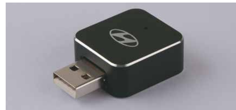
Wired to wireless adapter