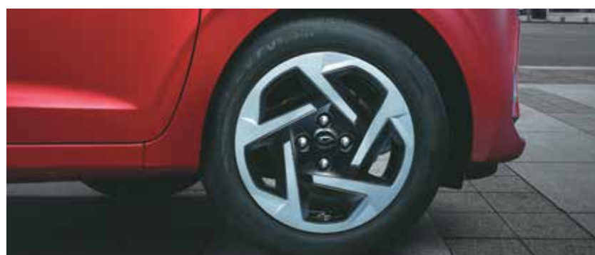
R15 (D = 380.2mm) Dual tone styled steel wheel