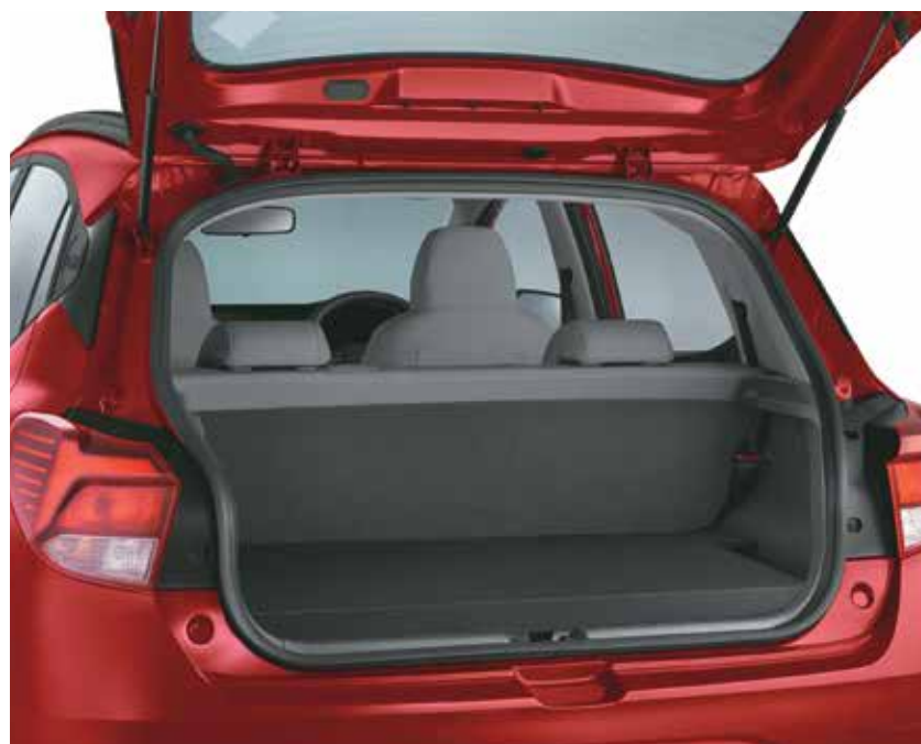
Spacious boot with company-fitted dual cylinder CNG

Hyundai Grand i10 NIOS Hy-CNG duo is engineered to optimize every journey. Equipped with a dual-cylinder system, it offers more boot space and fuel efficiency. It ensures you have all the room you need for your adventures while delivering exceptional performance.