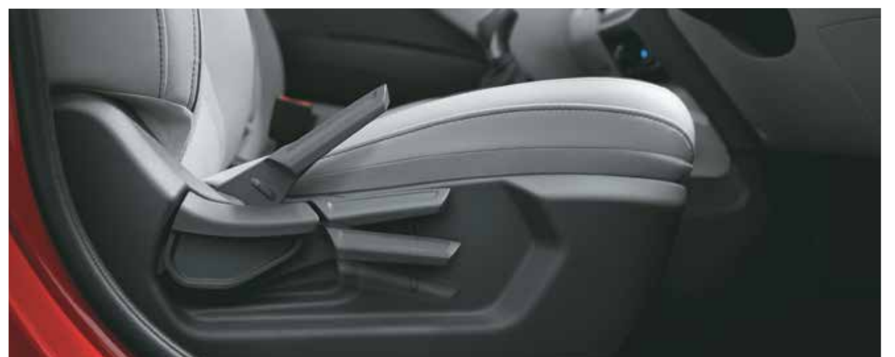
Driver seat height adjuster

Other features: Tilt steering | Adjustable rear headrest | Cooled glove box