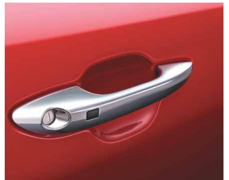
Chrome outside door handles