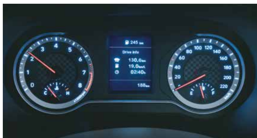
8.89 cm (3.5") speedometer with multi info display