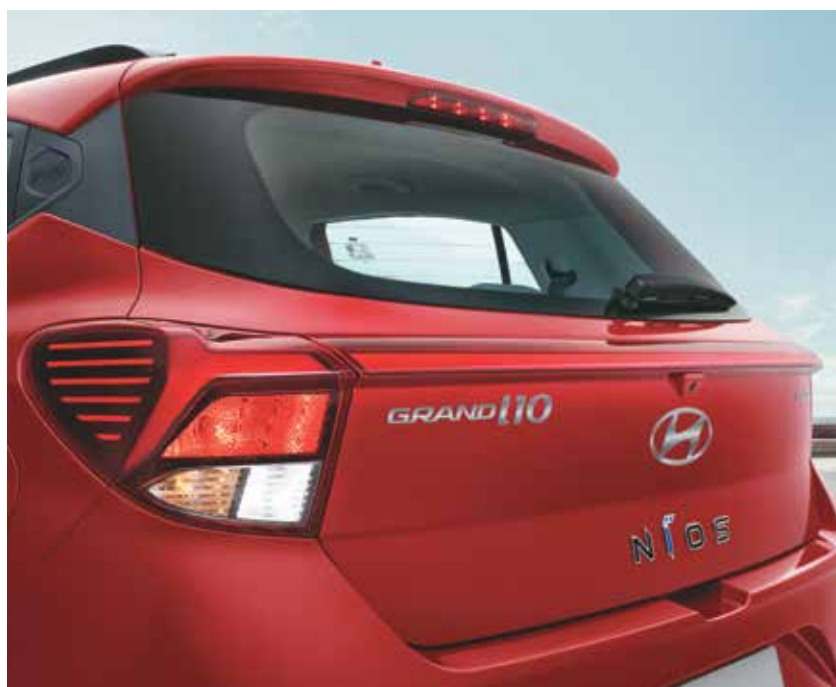
LED tail lamps