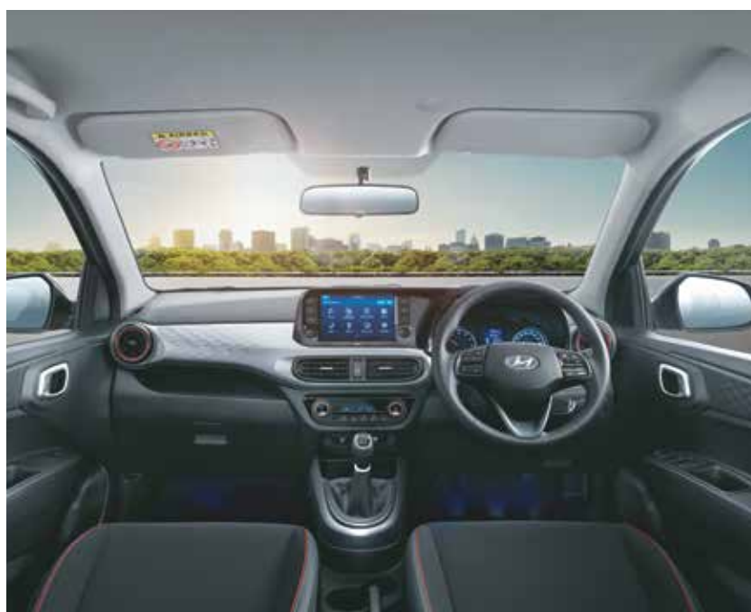
Black interior with red insert

Just the kind of drive that matches your vibe.