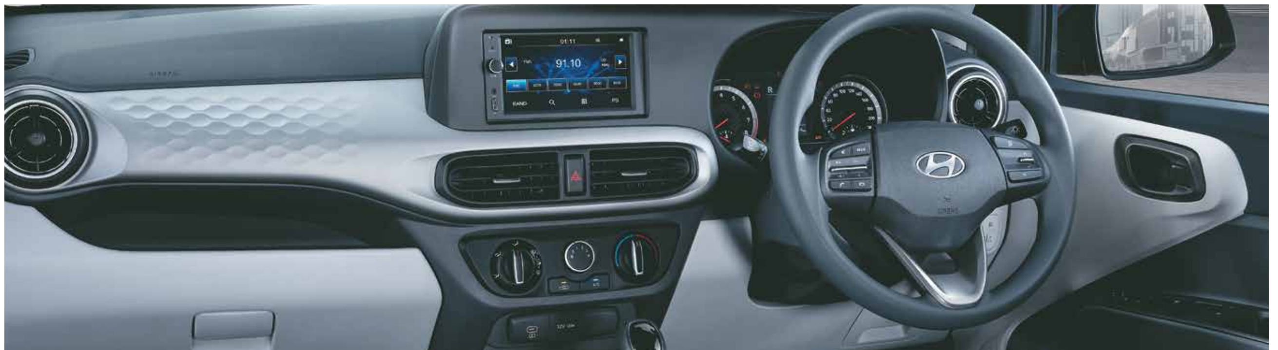
Dual tone grey interiors

Take control of your commute with the Grand i10 Nios corporate trim. Meticulously crafted to enhance your drive while exuding an executive presence. Experience the convergence of technology and design that features a monochromatic black interior punctuated by strategically placed red accents, and gleaming chrome details.