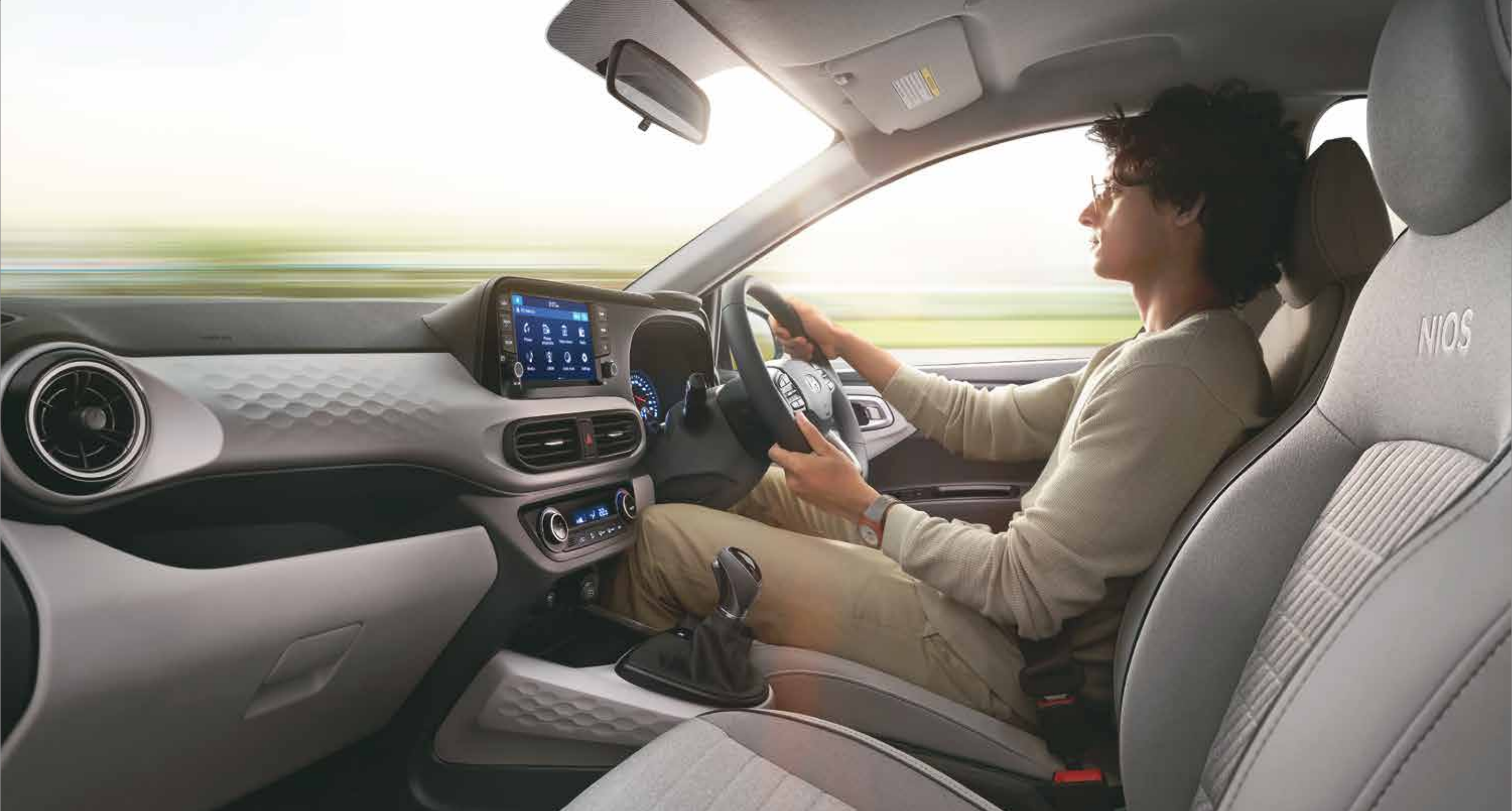
Dual tone grey interior