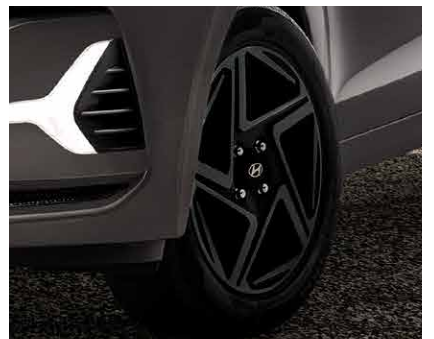
R15 (D = 380.2 mm), Black painted alloys