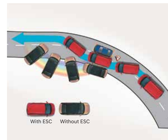
Electronic stability control (ESC) Vehicle stability management (VSM)

Other features: Child seat anchor (ISOFIX) | Driver rear view monitor (DRVM) | Speed alert system | Front seatbelt pretensioner with load limiters Burglar alarm | Rear defogger | Impact sensing auto door unlock | Speed sensing auto door lock | Headlamp escort system | Emergency stop signal