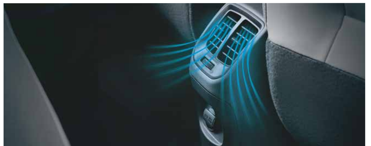
Rear AC vent