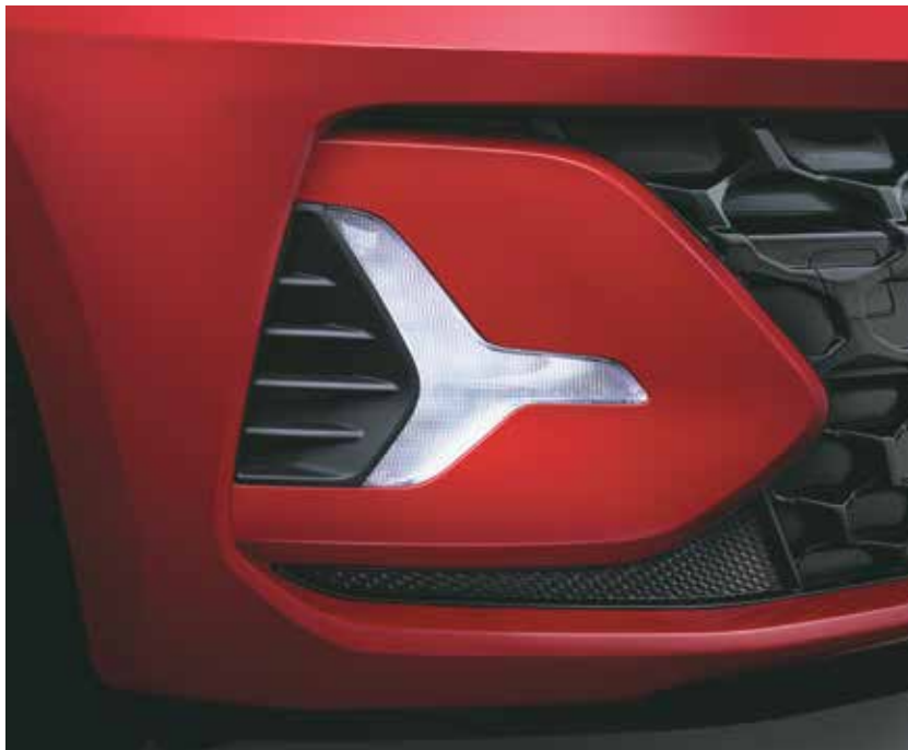
LED daytime running lamps (DRLs)