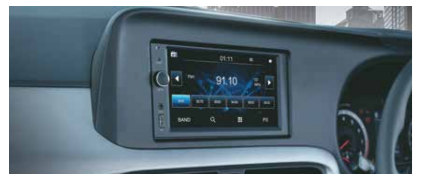
17.14cm (6.75") touchscreen display audio

Other features: 3 Point seat belts (All seats) | Seat belt reminder (All seats) | Headlamp escort system | Burglar alarm | TPMS - highline | 6 Airbags